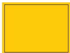
Full Page + Bleed