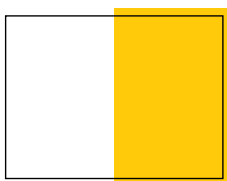
Half Page + Bleed