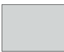
Full Page Trim